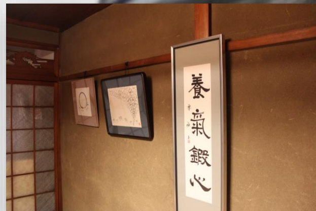
The teacher's works