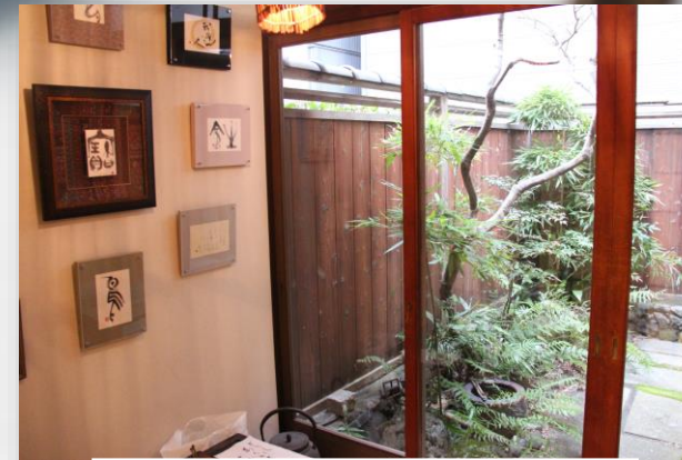
Indoor garden and works