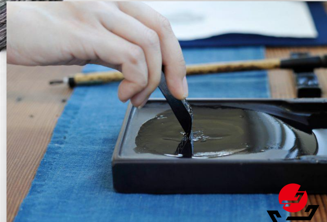
Grinding ink stick